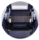
300-meter Ribbon Capacity