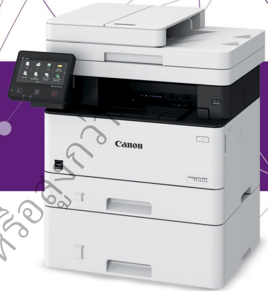
Shown with optional cassette.

Designed for small and medium-size businesses, the imageCLASS MF426dw/MF424dw models balance speedy performance, minimal maintenance, and the ability to add an extra paper tray. A 5" color touchscreen delivers an intuitive user experience and can be customized by a device administrator to simplify many daily tasks.