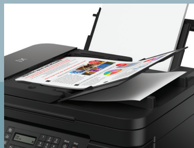
35 SHEETS AUTO DOCUMENT FEEDER