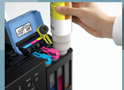
FAST, NO-MESS INK FILLING