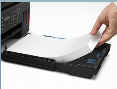
LARGE PAPER CAPACITY FOR MORE CONVENIENCE (Load up to 350 sheets)